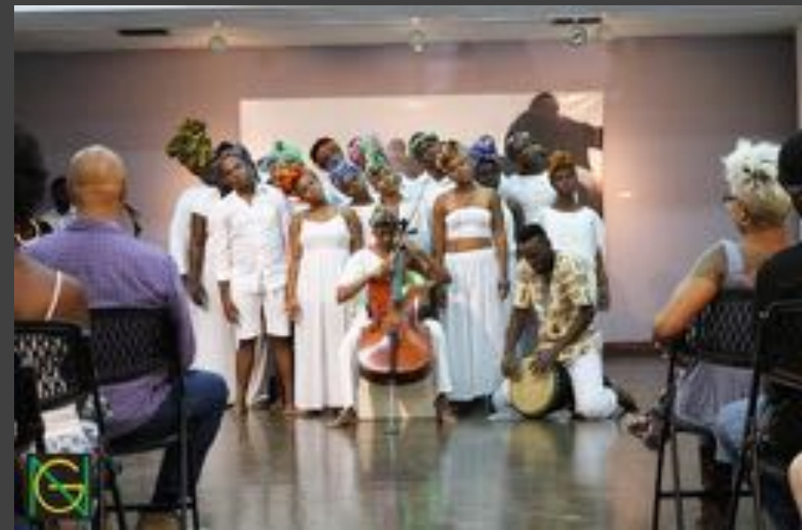
Last Sundays opening Sept 2018