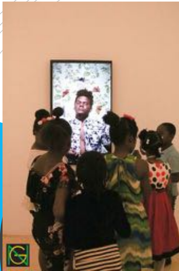
Tour of Beyond Fashion (2018) exhibition